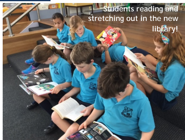
Students reading and stretching out in the new library!