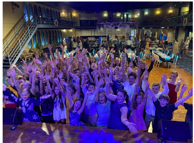
Farewell to our wonderful Year 6 students

The Uniform Shop will be re-open on Thursday 30 January 2020.