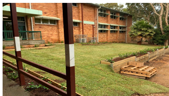
Our new improved front entrance